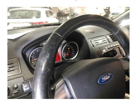
1. FRONT: Steering wheel - condition