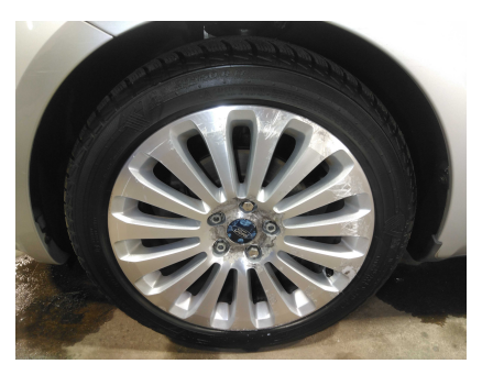
1. SIDE: Wheels - condition