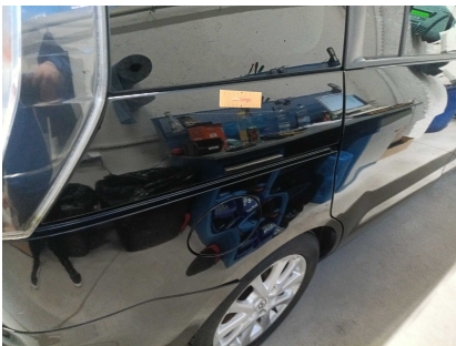
7. SIDE: Left and right side - visual damage / scratches