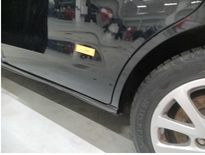
5. SIDE: Left and right side - visual damage / scratches