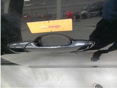
6. SIDE: Left and right side - visual damage / scratches