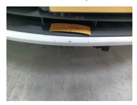
1. FRONT: Front bumper - condition and alignment