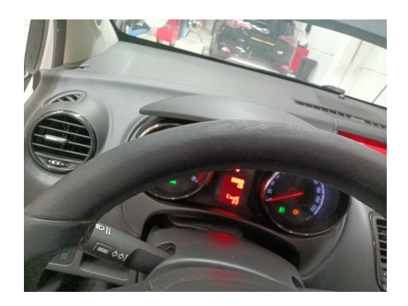
4. FRONT: Dashboard - condition; operation of buttons