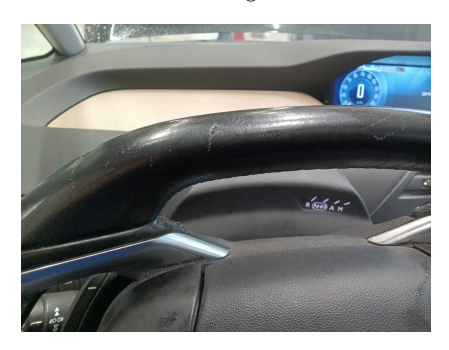
1. FRONT: Steering wheel - condition