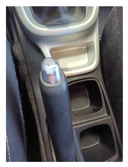
2. INSIDE: Gear shift boot/skirt and Gear shift knob - condition