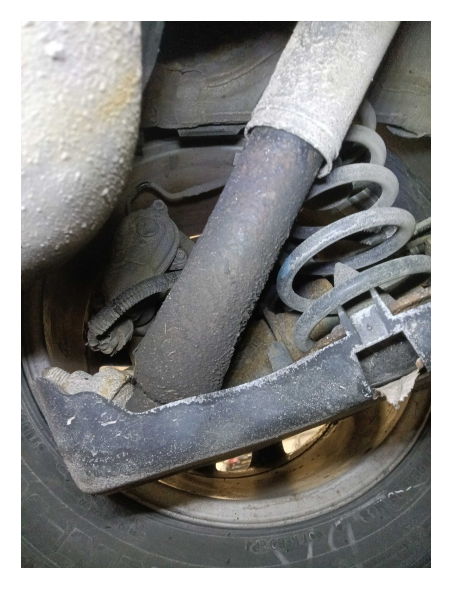
Diagnosis report of 2015 RENAULT MEGANE Stock ID: G509741