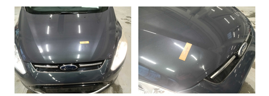
2. FRONT: Front bumper - condition and alignment