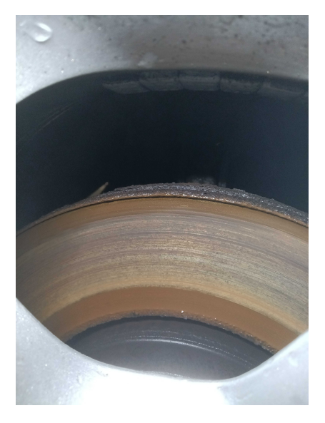
Diagnosis report of 2016 DACIA LOGAN Ambiance Stock ID: N904430