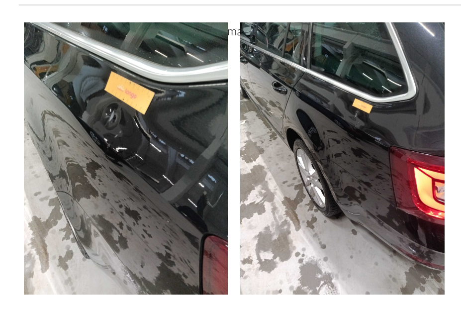
6. SIDE: Left and right side - visual damage / scratches