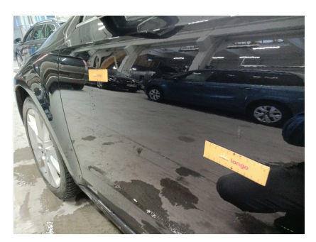
4. SIDE: Left and right side - visual damage / scratches