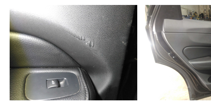
2. DOORS: Trims - condition