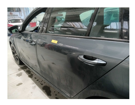
2. SIDE: Exterior mirrors - integrity of mirror itself and attachment to car