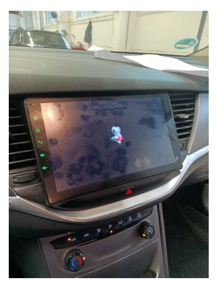
2. OPERATION: Navigation and Radio system - operation

1. OPERATION: Rear view camera / proximity sensors - functioning