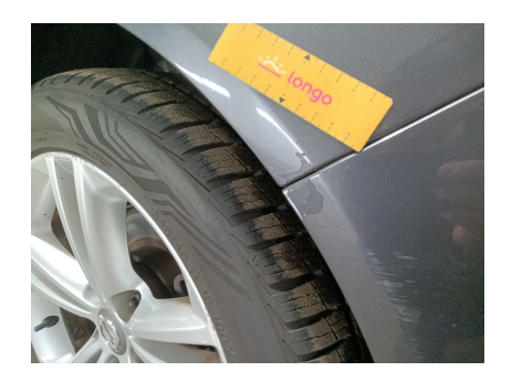
8. SIDE: Left and right side - visual damage / scratches