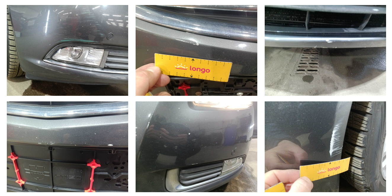
1. FRONT: Front bumper - condition and alignment