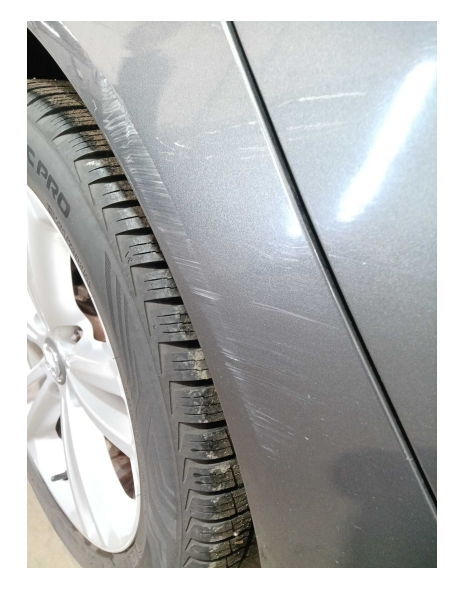
9. SIDE: Left and right side - visual damage / scratches