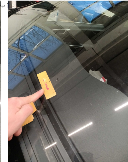
vehicle from MOT test