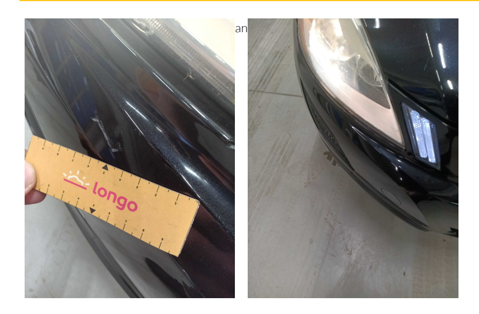
2. FRONT: Hood - visual damage