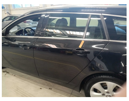
5. SIDE: Left and right side - visual damage / scratches