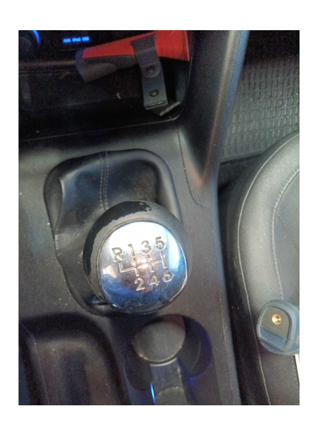
4. INSIDE: Gear shift boot/skirt and Gear shift knob - condition