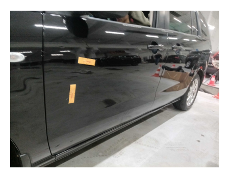
3. SIDE: Left and right side - visual damage / scratches

2. SIDE: Left and right side - visual damage / scratches