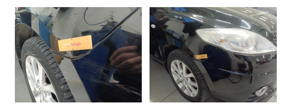
8. FRONT: Front bumper - condition and alignment