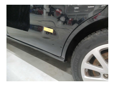
5. SIDE: Left and right side - visual damage / scratches