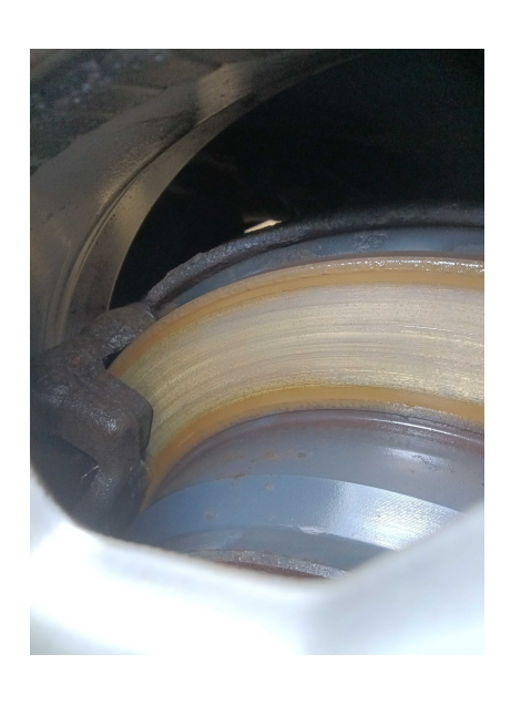
2. BRAKES: Front brake disc (both)