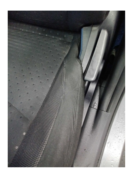
4. INSIDE: Trims - condition