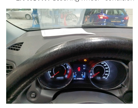
2. FRONT: Steering wheel - operation of controls/buttons