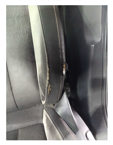
1. SEATS: All seats - condition