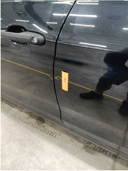
4. SIDE: Left and right side - visual damage / scratches