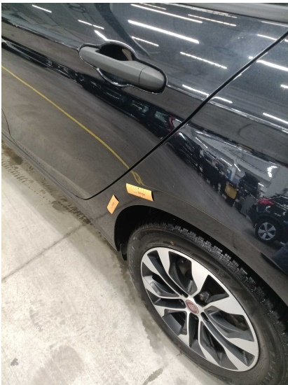
5. SIDE: Left and right side - visual damage / scratches