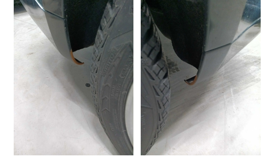
6. REAR: Rear bumper - condition and alignment