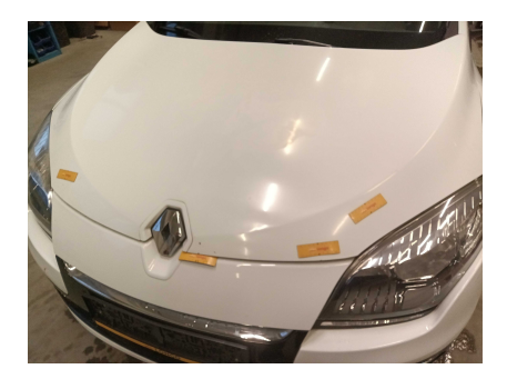
5. FRONT: Front bumper - condition and alignment