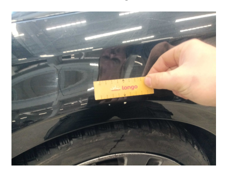
2. SIDE: Wheels - condition

1. SIDE: Left and right side - visual damage / scratches