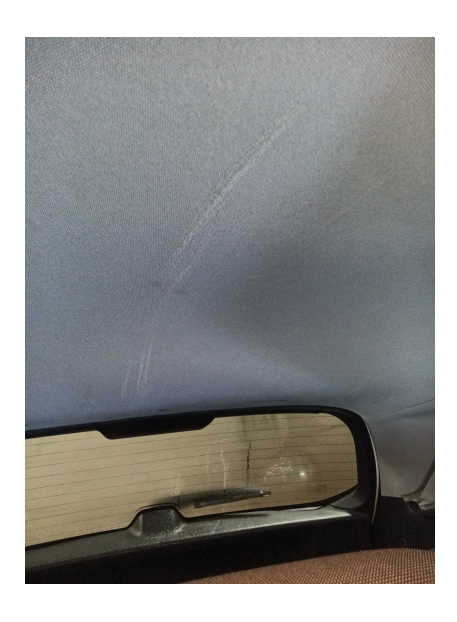
4. INSIDE: Parcel shelf - operation and condition