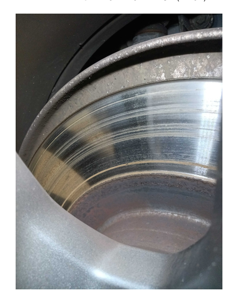
3. BRAKES: Front brake disc (both)