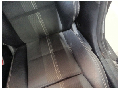
2. SEATS: All seats - condition