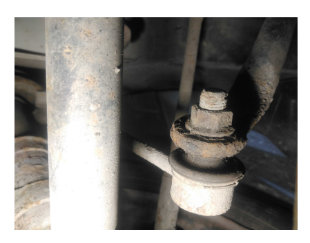
Anti roll bar link front