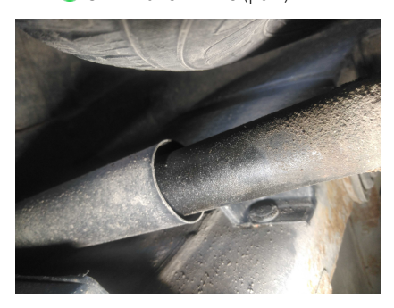
Shock absorbers (pair)