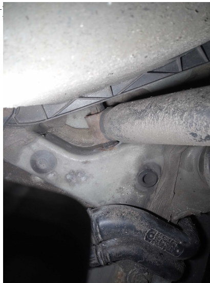
2. SUSPENSION: Shock absorber cover