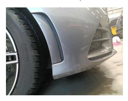
2. FRONT: Hood - visual damage

1. FRONT: Front bumper - condition and alignment