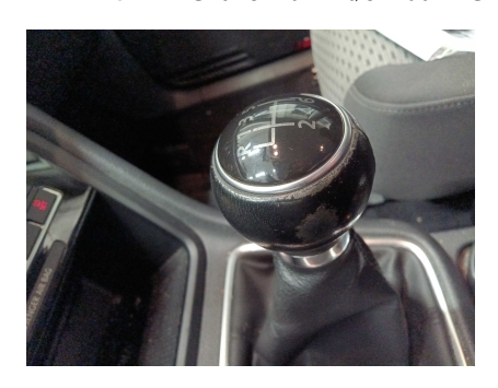
2. FRONT: Trims - condition

1. INSIDE: Gear shift boot/skirt and Gear shift knob - condition