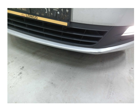
2. FRONT: Hood - visual damage