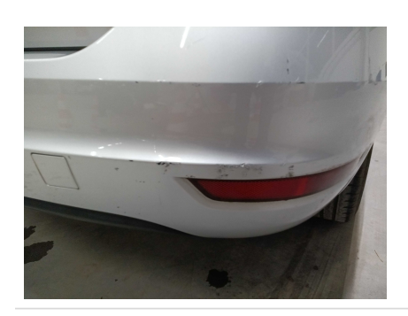
4. REAR: Trunk - visual damage