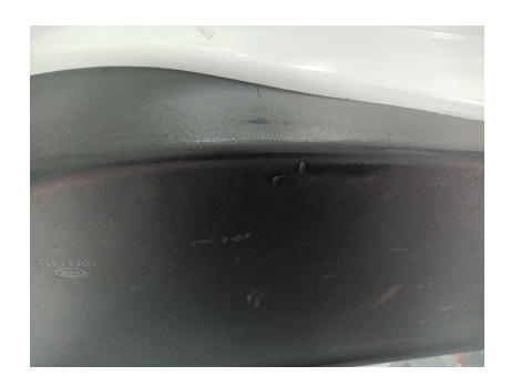
2. FRONT: Trims - condition