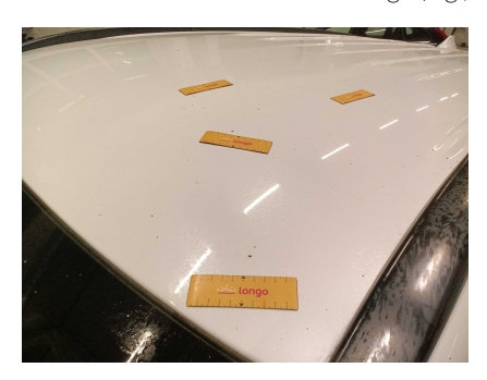
2. REAR: Trunk - visual damage

1. OTHER: Roof - visual damage (e.g., hail damage)