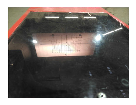
2. LIGHTS: Light Bulbs