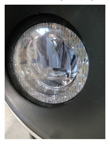
1. LIGHTS: Front lights (city, regular and full headlight, fog, indicator) - basic functioning, damage, color