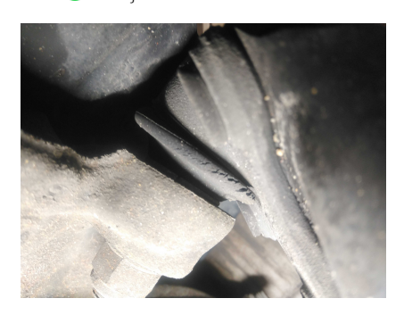
Ball joint - lower