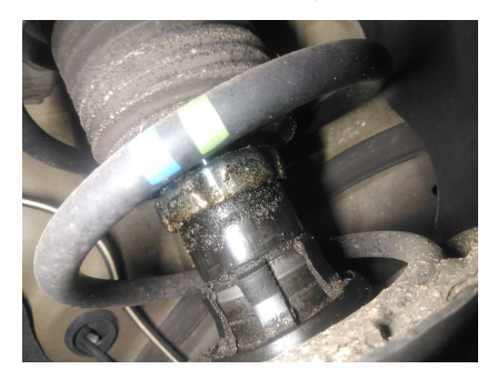
Shock absorbers (pair)