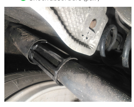
Shock absorbers (pair)