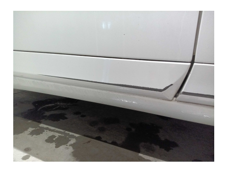
3. SIDE: Left and right side - visual damage / scratches