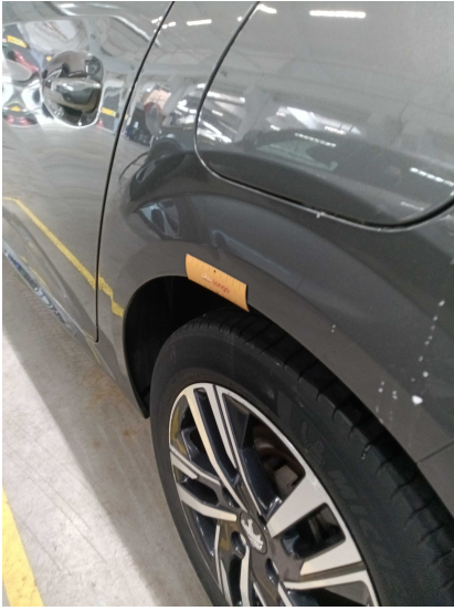
3. SIDE: Left and right side - visual damage / scratches