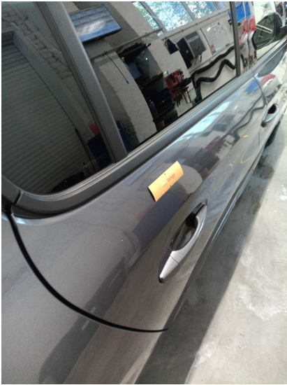
4. SIDE: Left and right side - visual damage / scratches