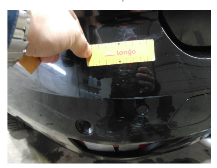
1. REAR: Rear bumper - condition and alignment