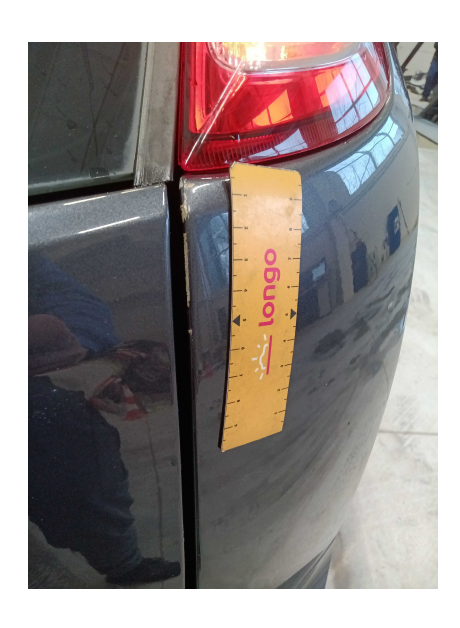
2. LIGHTS: Lights on car side - basic functioning, damage, color