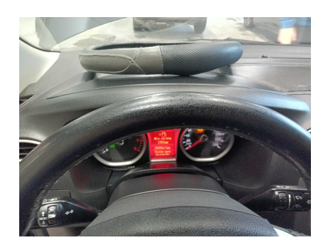
4. FRONT: Headlinig - condition