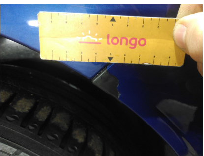
2. SIDE: Wheels - condition