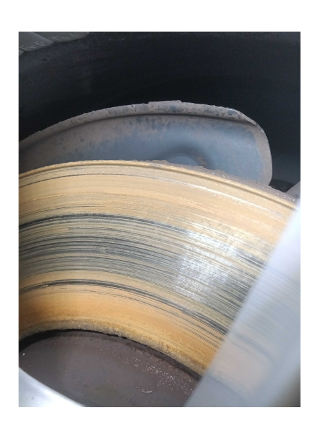
2. BRAKES: Rear brake disc (both)