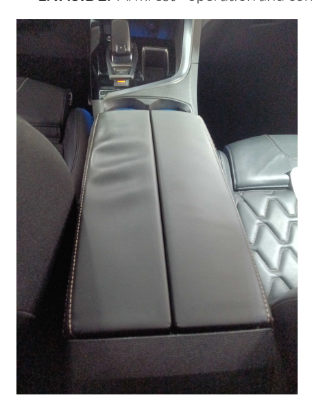
2. INSIDE: Trims - condition

1. INSIDE: Armrest - operation and condition