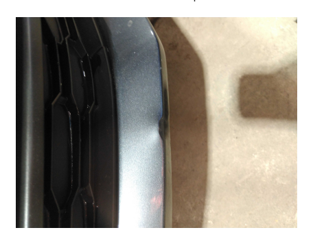
2. SIDE: Left and right side - visual damage / scratches

1. FRONT: Front bumper - condition and alignment