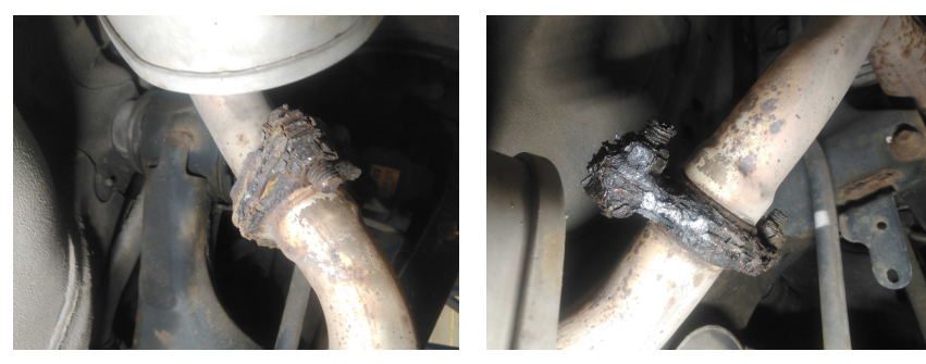
3. EXHAUST SYSTEM: Exhaust connection