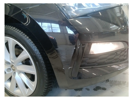
2. FRONT: Hood - visual damage