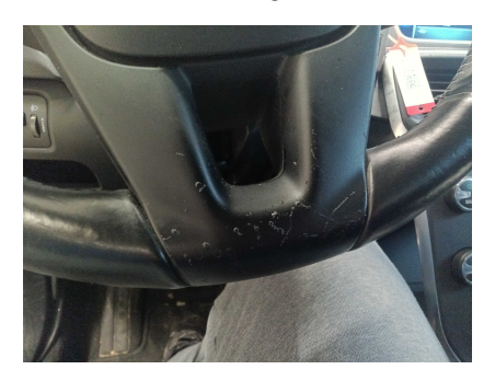
1. FRONT: Steering wheel - condition