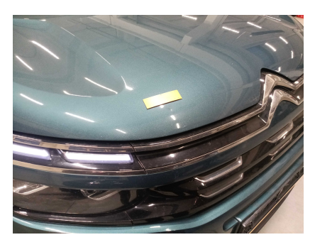
2. SIDE: Left and right side - visual damage / scratches