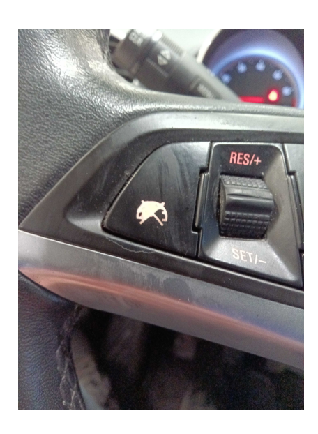
4. INSIDE: Trims - condition