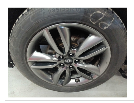
3. SIDE: Left and right side - visual damage / scratches