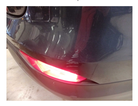
1. REAR: Rear bumper - condition and alignment